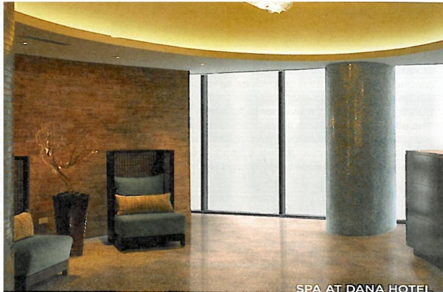
SPA AT DANA HOTEL

One of the newest additions to Chicago's spa scene, this spot is built to impress. Green mosaic tiles shimmer in the oval-shaped lobby, while all treatment rooms include an iPod-ready Bose stereo—so you can be buffed and polished to your own beat. Signature treatments include the Aromasoul Massage ($95), which incorporates essential oils from India, Asia, the Middle East and the Mediterranean. Or try the Nourishing Organics Manicure ($35), which wraps hands in a mask made from pumpkin, tomato, artichoke and beet. Afterward, work up a sweat in the spa's cutting-edge gym—its ultra-sleek fitness equipment, called "Technogym," will give you a great workout. After your treatment, you might want to check out the "true daylight" mirrors in the locker rooms, which are great for applying makeup.